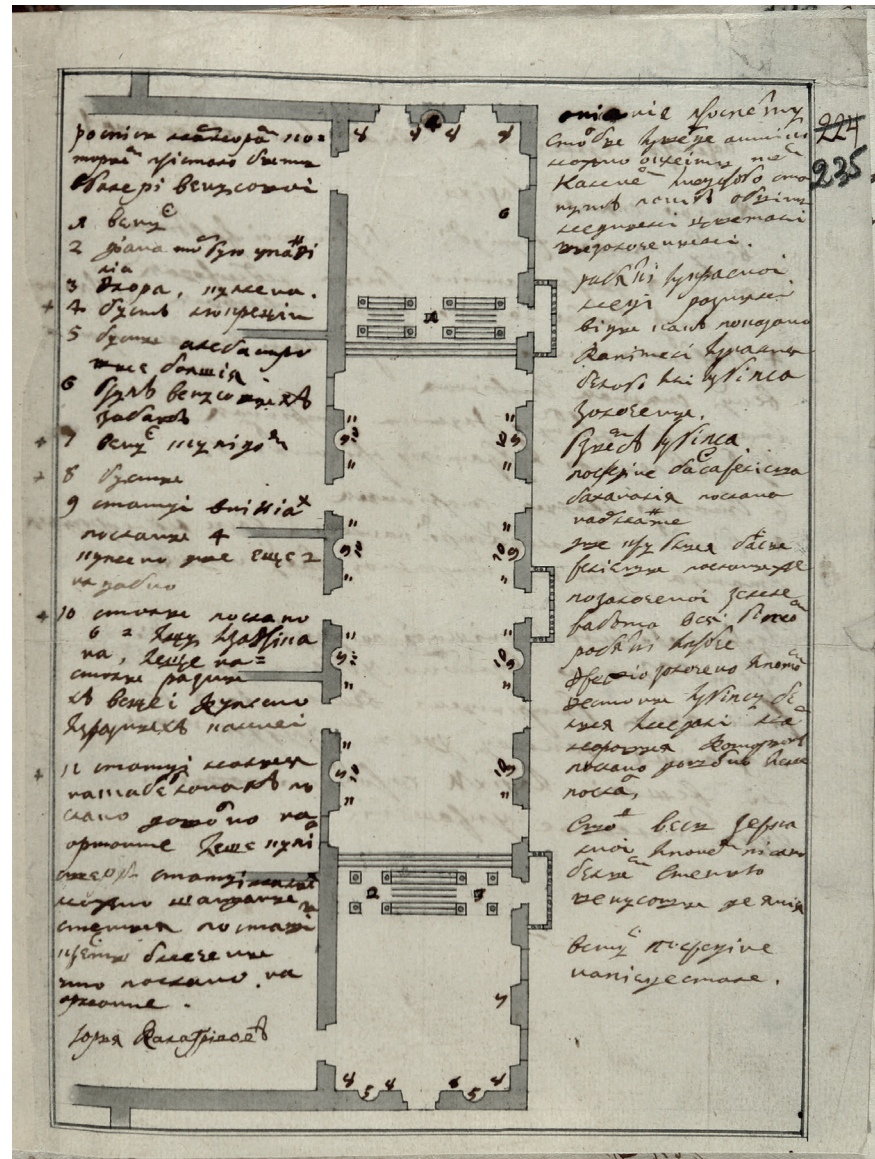
FIG. 2. YURI I. KOLOGRIVOV. DRAWING OF A GALLERY WITH MARBLE STATUES. RGADA, F. 9, P. II, BOOK 41, FOL. 235.

including the statues purchased later, mentions the group of Venus, Cupid and 'pigeon under foot' (that of Cupid, I imagine). On the other hand, it is quite possible that Kologrivov simply wanted to