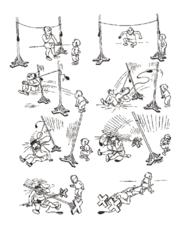
Fig. 1. Black-and-white elements – story pictures

The study took place directly at the school in a separate class and with each student individually. On the computer screen, the verbal and nonverbal stimuli were successively presented to the adolescents. The average duration of the examination of the adolescents was about 20 minutes. On viewing each stimulus, they were asked to fill in a short questionnaire whose questions were about the comprehension of the presented text and picture. In case when the examinee found it difficult to fill out the questionnaire on his own, the psychologist asked leading questions invidually.