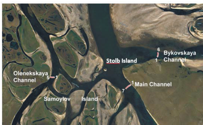
Fig. 1. The position of the measurement stations on the channels of the Lena River delta in April 2019.

The study was conducted on the cannels of the Lena River delta on 10-17 April 2019. The Lena River delta is a site typical of Northern Yakutia, playing a huge hydrological and environmental role in the natural functioning of the large river basin and also affects the climate and ice processes in the Laptev Sea. Measurements of water temperature, conductivity, dissolved oxygen, PAR and currents were carried out in the Bykovskaya and Oleneskaya channels as well as in the main channel of the Lena River near Stolb Island (Fig. 1). Profiles on the main channel and Bykovskaya channel were located at representative (standard) channel positions according to Russian Hydrometeorological Service. At each profiles 5-7 stations were done at a distance of about 75-150 m from each other. Multiparameter probes CTD-48M, CTD-90M and RBR-Concerto were used. The vertical soundings were carried out from the lower boundary of the ice to the bottom sediments with a vertical step of 5-8 cm – horizons on 15, 65 and 85% of a depth. Measurements of a snow and ice thickness were done at each station additionally. Water discharge ( Q ) have been calculated by the equation Q=F*v , were F – is a square of a channel profile, and v is the current velocity (Fedorova et al., 2015).