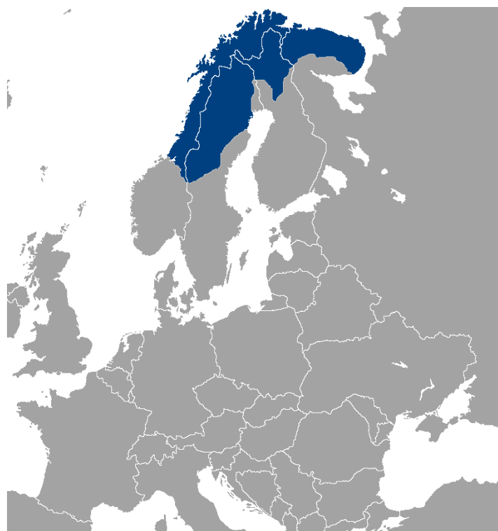
Figure 1. The distribution area of the Saami and their compact residence in the 21st century

However, it is not easy to discuss the prospects for the development of the cross-border movement of the Saami. On the one hand, the results already achieved allow the majority of Saami communities to feel comfortable in the states they reside in (which cannot be said about the Saami neighbors in the region - the Scots, or European neighbors - the Basques, Irish, Catalans, Flemish, Walloons, Transvaals, and many others.). On the other hand, the ongoing climatic changes and emerging prospects for the development of various minerals in the Saami regions of residence lead to political, territorial and structural changes in their lives (which can be illustrated by the history of the development of the indigenous small-numbered peoples of the North, Siberia and the Far East in the USSR). The influence of states interested in their presence in the Arctic should also be taken into account [23].