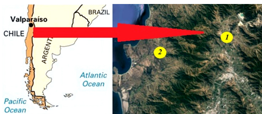
Figure 1. The area of investigation; 1 – El Melón; 2 – Puchuncavi

Topsoil samples (0–20 cm) were collected from 8 sites currently used for agriculture in the El Melón and Puchuncavi valley that have been contaminated by copper mining and smelting activities (Figure 1). Both fields were managed with perennial Lactuca sativa over many years before the sampling. An expert judgment sampling approach was used (Petersen & Calvin 1996; Aguilar et al. 2011). The sampling locations have been chosen based on a previous investigation of the Cu spatial distribution (Gonzalez et al. 2014; Moya et al. 2017). The soil samples have been collected from the soils classified as entisols (Soil Survey Staff 2003). The procedure for the soil properties determination has been described previously by Moya (Moya et al. 2017). The determination of the main soil parameters has been performed by standard procedures. The values of the pH in the water and salt suspension were measured using a pH-150 meter (1 : 2.5 soil : solution ratio). The grain size distribution has been determined by the