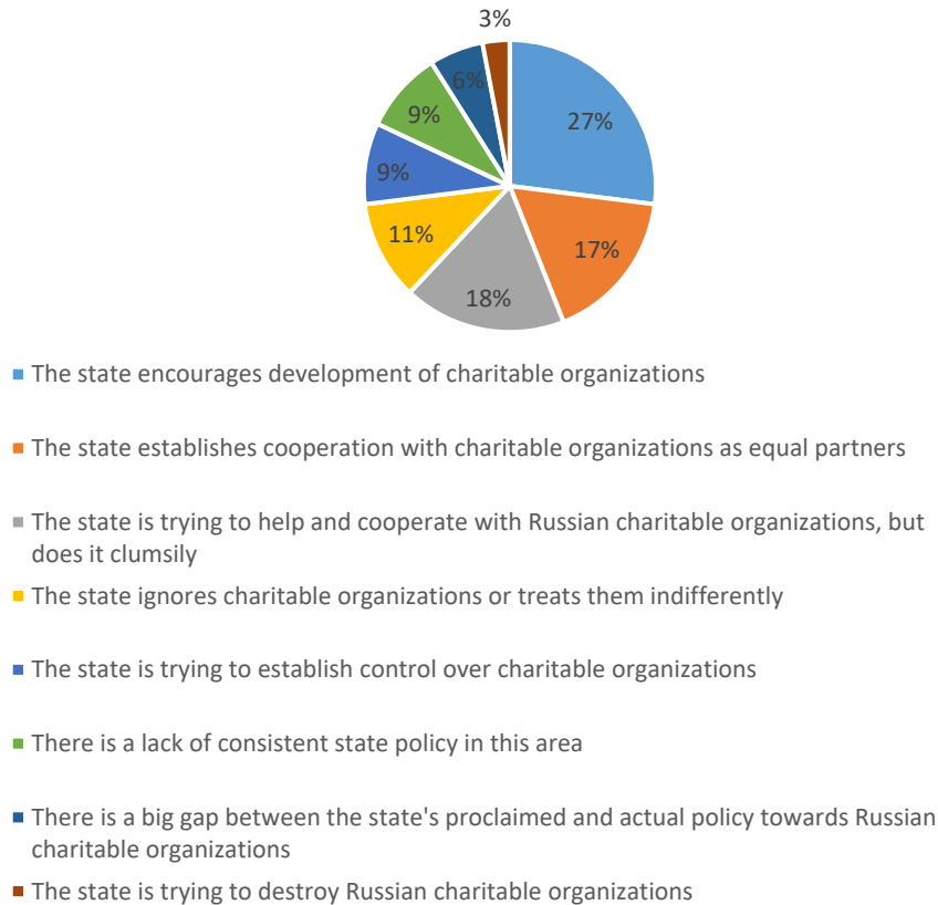
Figure 1. The results of in-depth interview (2017). The question: in what way could you evaluate relations between the state and Russian charitable organizations?

sixth (18%) agrees that the state is trying to help and cooperate with Russian charitable organizations, but does it clumsily. According to 11 % of respondents, the state ignores such organizations or treats them indifferently. According to 9% of respondents, the state is trying to establish control over such organizations. Only 3 % of the population adhere to a very extreme point of view, believing that the state is trying to destroy Russian charitable organizations. 9 % of respondents noted a lack of consistent state policy in this area, and 6% believe that there is a big gap between the state's proclaimed and actual policy towards Russian charitable organizations.