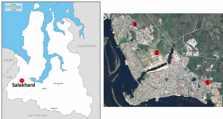
Fig. 1. Location of Salekhard on the map of Yamal region and sample sites. 1 – Sal1; 2 – Sal2; 3 – Sal3.

annual evaporation rate is about 250 mm (Shiyatov et Mazepa 1995). The number of days with snow cover is 233 per year. Winter lasts 7 – 7.5 months, the average temperature of January is -23 - -25^{\circ}\text{C} . Spring is usually short (35 days) and cold, with a sharp change in weather, with frequent returns of cold and frost. The vegetation season is 70 days. Average temperature of the warmest month is + 5^{\circ}\text{C} . The average annual temperature is -5.8^{\circ}\text{C} . Autumn is short, with a maximal volatility of the pressure gradient, an abrupt change in temperature and frequent early frosts. The site is in a zone of excessive moisture (Shiyatov et Mazepa 1995).