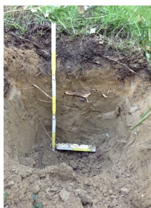
Fig. 2. Studied soil profiles. Sal1- Sandy Agrozem with overcompaction properties underlain by permafrost (Spodic Anthrosol); Sal2- Sandy Agrozem underlain by permafrost (Spodic Anthrosol); Sal3- Sandy Podzol underlain by permafrost (Spodic Anthrosol).