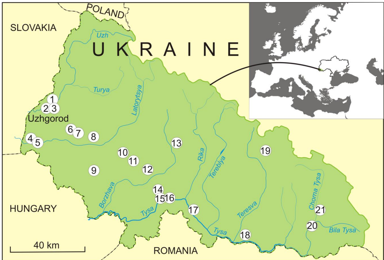
Figure 1. Map showing the localities of samples studied. Details for each sampling point are given in Table 1.

In total, over 250 specimens of pond snails from 21 localities were examined (Table 1). A traditional morphological analysis and measurements of the shell were used for species differentiation. In some doubtful cases a dissection was performed to study the taxonomically significant parts of the reproductive system of the molluscs.