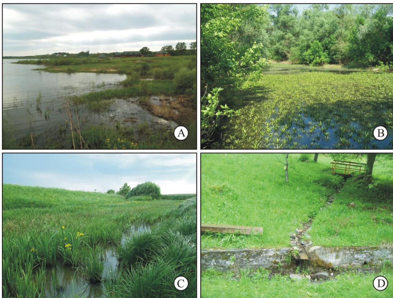
Figure 2. Selected types of ecotopes inhabited by lymnaeids in Transcarpathian region. A – pond in the vicinity of Gorbok village, Irshava district, locality 11; B – artificial pool in the floodplain of Latorica River, near Chop Town, Uzhgorod district, locality 5; C – canal between Stare Davidkove and Ivanivtsi villages, Mukacheve district, locality 8; D – stream in the territory of Carpathian Biosphere Reserve Headquarters, locality 20.

There is no universal, commonly accepted system of the European lymnaeids. The Western European authors (Jackiewicz 1998; Glöer 2002; Welter-Schultes 2012; Piechocki & Wawrzyniak-Wydrowska 2016) recognize a relatively low number of valid specific taxa (12–15), whereas malacologists of the former USSR use a drastically different system (Kruglov & Starobogatov 1993a, b; Stadnichenko 2004; Kruglov 2005). The molecular-genetic approach has recently become a key tool in the European lymnaeid systematics (Bargues et al. 2003, 2006; Schniebs et al. 2011, 2013; Vinarski et al. 2012b), but some morphologically distinct species still remain not studied genetically that keeps some questions concerning their validity and the taxonomic status unresolved. The taxonomic problems are beyond the scope of our study, and here we generally follow the most recent system of the Ukrainian lymnaeids (Stadnichenko 2004), with taking into consideration the taxonomic publications issued later (e.g. Vinarski & Glöer 2007, 2008; Mezhzherin et al. 2008; Schniebs et al. 2011, 2013; Welter-Schultes 2012). The generic and subgeneric classification of Lymnaeidae follows Vinarski & Kantor (2016). The distribution data of lymnaeid species listed herein are given after Hubendick (1951), Kruglov & Starobogatov (1993a, b), and Vinarski & Kantor (2016).