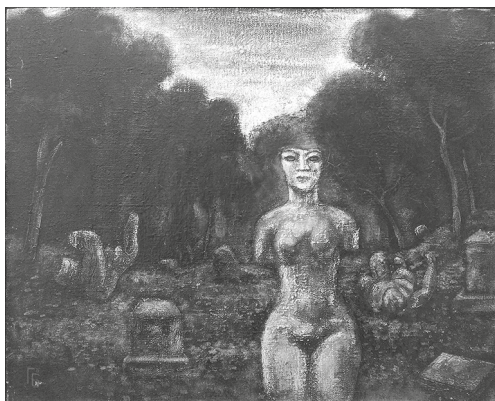
Fig. 2. Gleb Bogomolov. Phantom IX. 1975, oil on canvas. The Museum of Nonconformist Art, St. Petersburg

va, Gleb always noticed “vice sealed faces” in the crowd and studied them 1 .