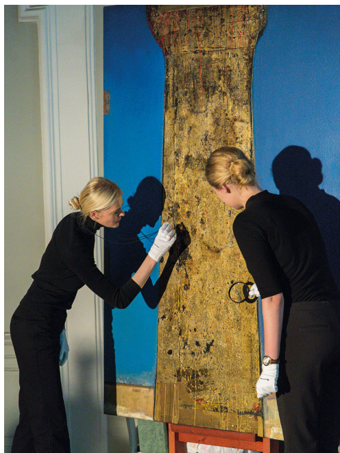
Ill. 163. Presentation of 'Aegina' by G. Bogomolov as the emblem of VII Actual Problems of Theory and History of Art International Conference, 11 October 2016, St. Petersburg.