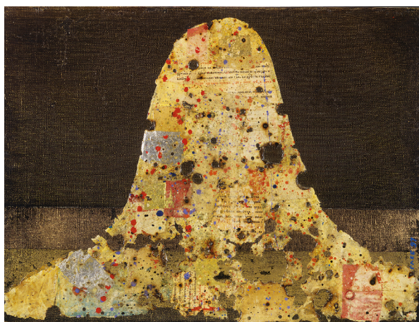
Ill. 159. Gleb Bogomolov. Maphorion. 1997. 80 × 100 cm, mixed media on canvas. Private collection.