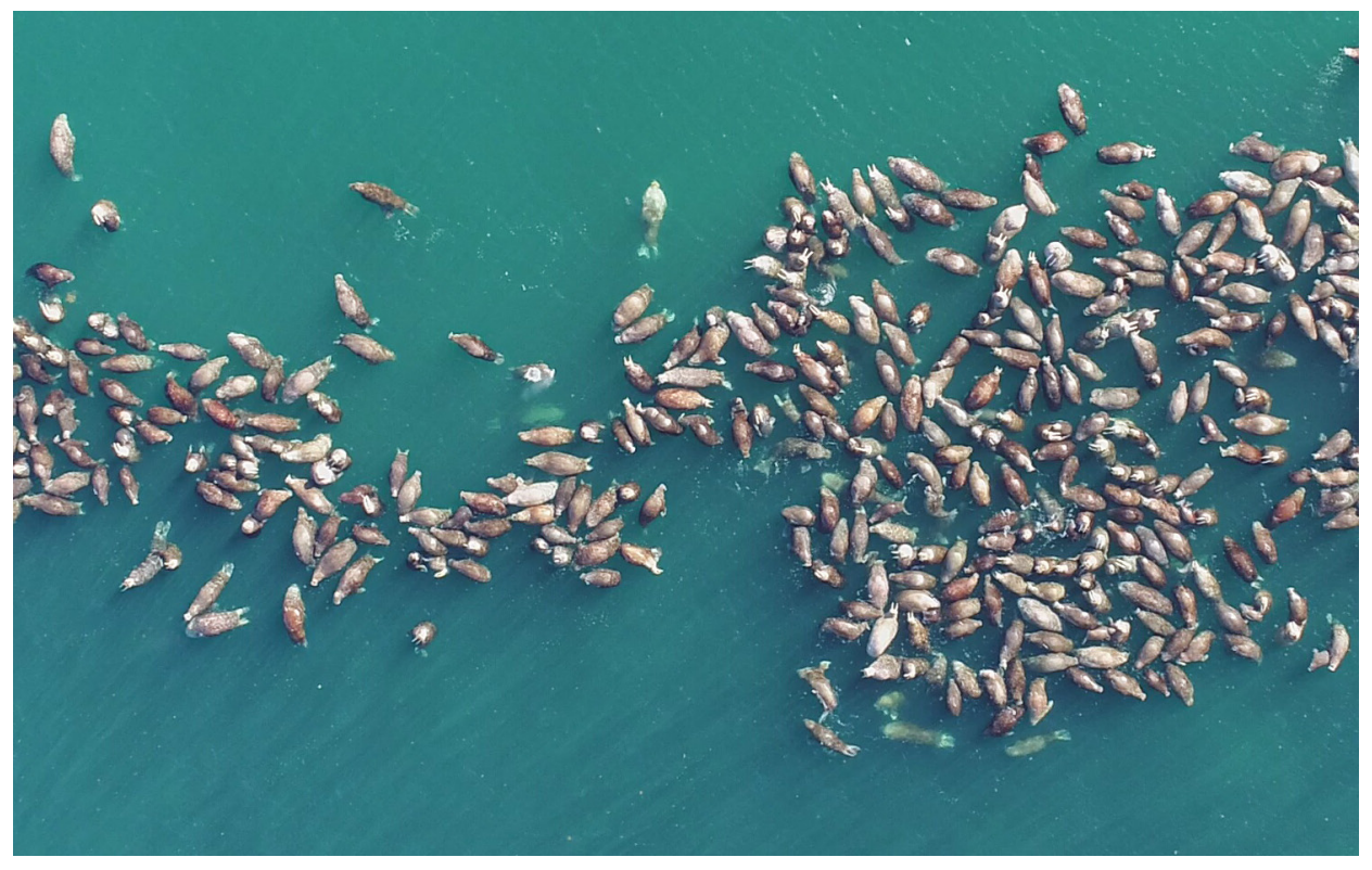
Fig. 2. A typical group of the Odobenus rosmarus individuals in water off Kolyuchin Island haulout (Chukchi Sea, Russia).

In the analysis, each outlined group (or «nongroup») was a sampling unit, for which we computed a median value of inter-individual distances by pooling the data from all individuals. This approach was successfully applied previously in a study on group cohesion in Dama dama Linnaeus, 1758 (Focardi & Pecchioli, 2005). We performed a mixed linear model (LMM) that generalises an ANOVA with the use of random-effects parameters, which may impact the variability of the data (Table S1). To model the data, the median distances were used as a variable, group/ non-group was used as a factor, the haulout site as a cluster variable, the number of individuals and the area occupied by the group/non-group as covariates. The areas occupied by the groups/non-groups were measured in «square walrus lengths» with the ROI (regions of interest) tool in ImageJ (National Institutes of Health, USA). Log transformation of the data was applied for normalisation of the residuals.