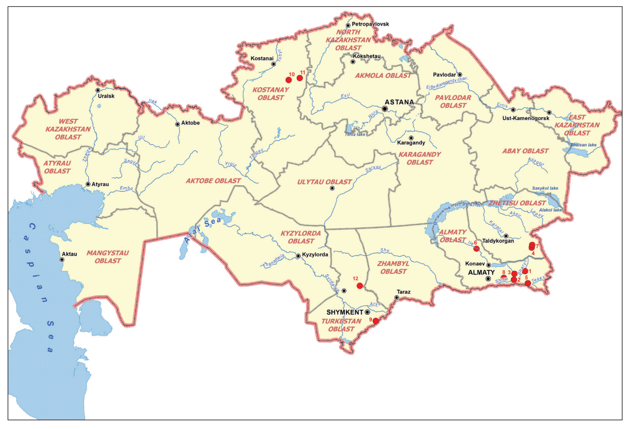
Figure 1. Sample localities in Kazakhstan.