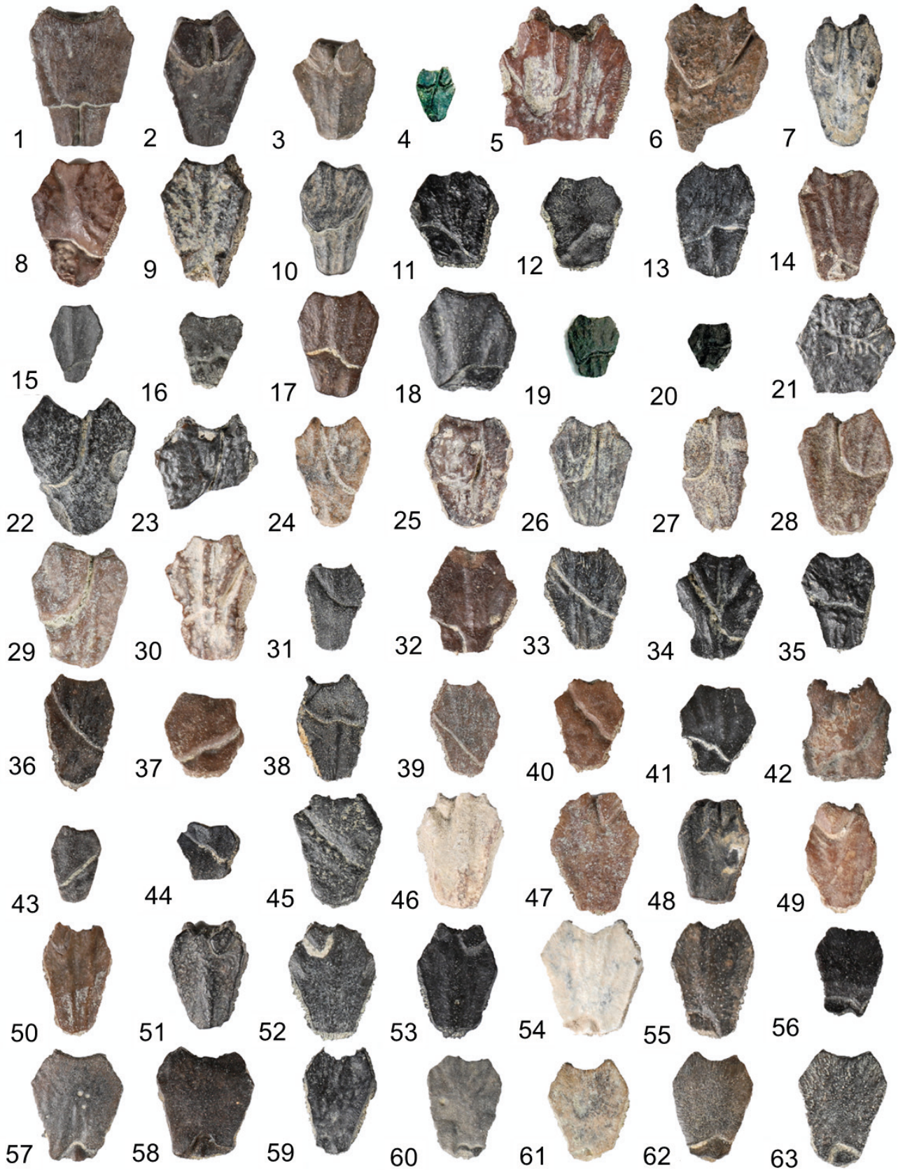
Fig. 2. Dorsal view of the neurals of Anemys variabilis with the atypical position of the sulci. Numbers correspond to those in Table.