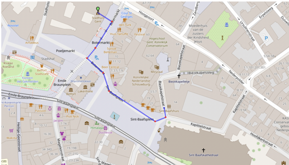
City Hall (Botermarkt 1) to St Bavo's House (Biezekapelstraat 2): 180 m